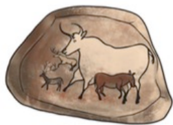
People make cave paintings.