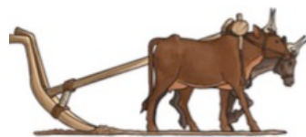
Farming starts and begins to spread.